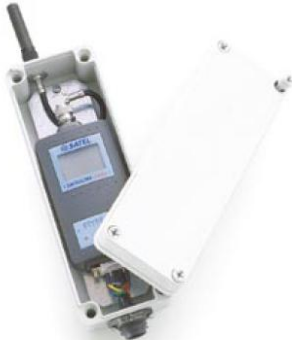
Fig. 1. Weather proof housing H-WP, YI0001. Typical delivery doesn't contain radio modem and antenna.